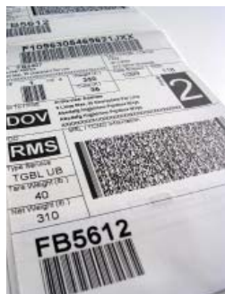
Military Shipping Label or MSL: This is the DoD label that has all the shipping and product information included.