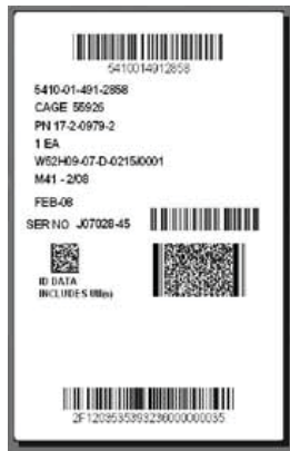
MIL-STD-129 Exterior Label: Normally you would use this along with the UPS or FedEx label. The label will look similar to that shown here to the left.

There are 3 exterior label possibilities: